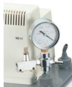
Vacuum Gauge / Regulator