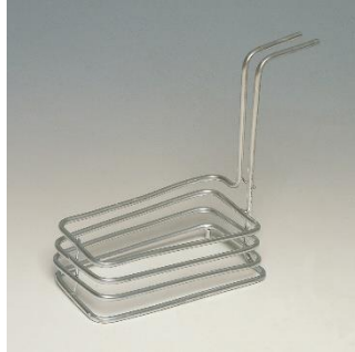
VC-10 Cooling Coil