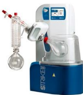
STRIKE 280 M2 / M5 Vertical glassware (Steam sinking type)