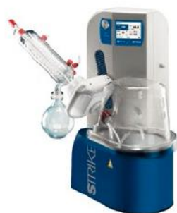
STRIKE 280 M1 / M4 Slanting glassware