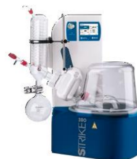
STRIKE 280 M3 / M6 Vertical glassware (Steam rising type)